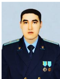
Artur BAYMAKHANOV © D.Sc. in Law (Academy of Law Enforcement Agencies under the General Prosecutor Office of the Republic of Kazakhstan), Kazakhstan