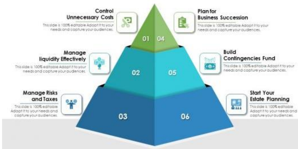
Figure 2 – Branding Strategy Pyramid of Effective Financial Strategies for Business Owners