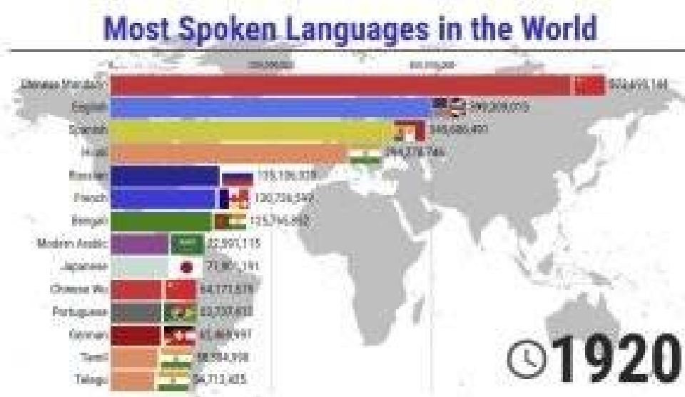
Fig. 2 – The most widely spoken languages in 1920

If to compare contemporary results with data of more than 100 years (Fig. 2), we will see that every language has been replaced from the initial position due to particular reasons and now has a different rate of popularity. At the same time, some languages have completely disappeared from the chart, while others substituted them. And if to counter today's tendencies, national languages of smaller countries might become more popular and widely spoken, though we will hardly see them in the top of the world spoken languages rate. But who can predict the results for 3020 s ?